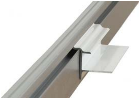
Slat Wall Shelf Bracket