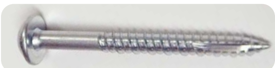
2 1/2" Bear Claw Screw